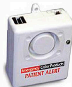
Patient Alert™ Unit