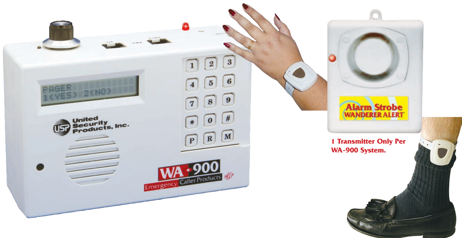
1 Transmitter Only Per WA-900 System.

Detects patients wandering away and then sounds the alarm and calls for help!