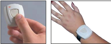
Pendant transmitters come complete with all accessories: Attachment cord, wrist band, necklace, surface mounting and belt clips.

Pendant Transmitters are attached to a cord, on wrist, necklace, beltclip or mounted. A simple press of the button sends the signal to EM-900 to sound alert and display LCD entered information. Pendants are supervised by EM-900 and Automatically send alert and displays whenever Pendant is missing such as a "Walk Out" patient. Man Down Pendant is Automatic and signals when patient is horizontal (Fall). All EM-900 transmitters automatically send signal to alert low transmitter battery .