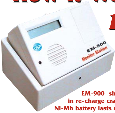
EM-900 shown in re-charge cradle. Ni-Mh battery lasts up to 8 hours.

1. The EM-900 Monitor Station is fast and easy to set up and use. Enter information for each transmitter, ex: Event - Name - Location . You can enter any information (up to 15 characters) that will be displayed on LCD screen. It will Beep Alert and Display entered information whenever a transmitter is activated . "Call Waiting" will retain up to 10 multiple incoming calls . Data Log retains calls for evaluation. Aux. out for Automatic Voice Dialers calls cellphones, pagers and telephones .