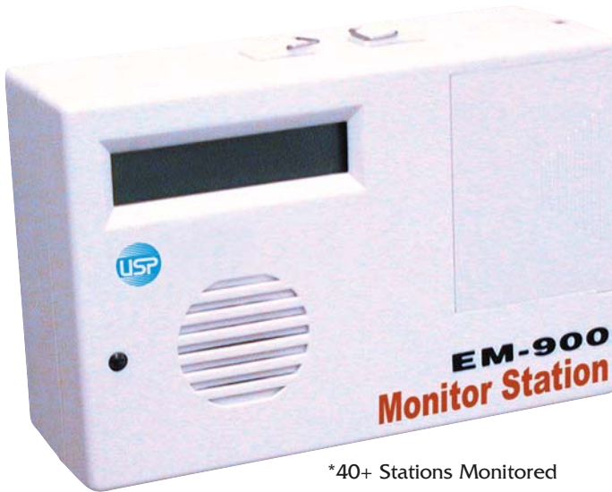
*40+ Stations Monitored

Wireless Long Range 900 MHz- up to 1000 ft. indoors- through walls, floors and ceilings!